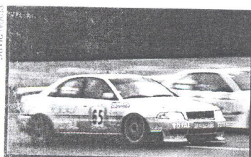
The Hemroulle/Verbergt A4 suited the wet